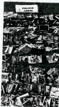
PIRATED CDs, CONFISCATED.

The statement follows a recent incident in which a Local Police officer was injured by a man who only days earlier had been reported for selling counterfeit goods. Members of the CIT have, in the past, been involved in a number of municipal campaigns in an attempt to eradicate street selling.