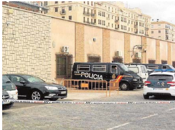
The warehouse, located in the Muelle Heredia area of the port.